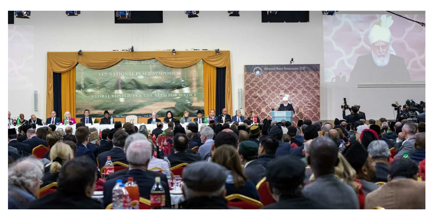
"In terms of the major religions, the unifying figure is God Almighty Himself, but this does not mean that a religious person can have nothing in common with a non-religious person. Thus, the Quran has taught us how to build a peaceful, multicultural society, where people of all faiths and beliefs are able to live side by side. The key ingredients are mutual respect and tolerance."

and animosity. Instead, the need of the hour is for us to knock down the barriers of fear that divide us. Rather than erecting walls that keep us apart, we should build bridges that bring us closer together.