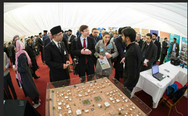
Various exhibitions about the community's work were featured at the event.