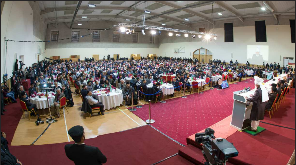
Over 900 people attended the Symposium and were also given a tour of the Baitul Futuh Mosque complex.