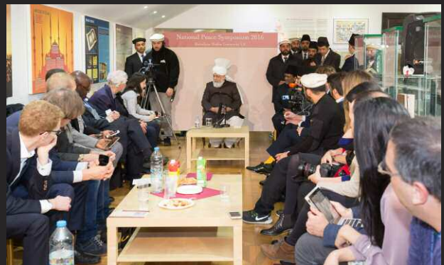
Meeting with members of the British press.