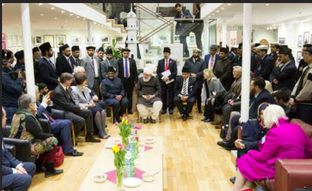
Meeting with Parliamentarians and diplomats.