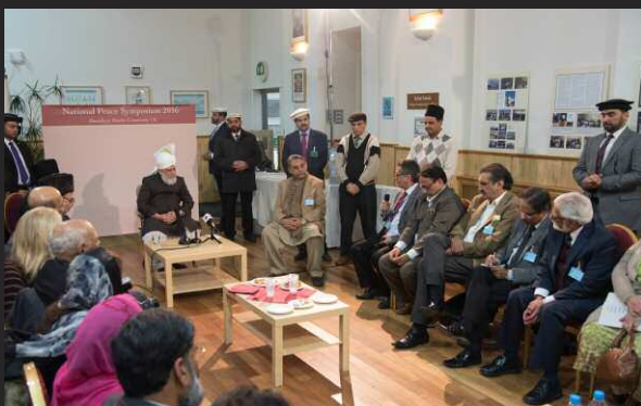
Meeting with members of the Asian press.