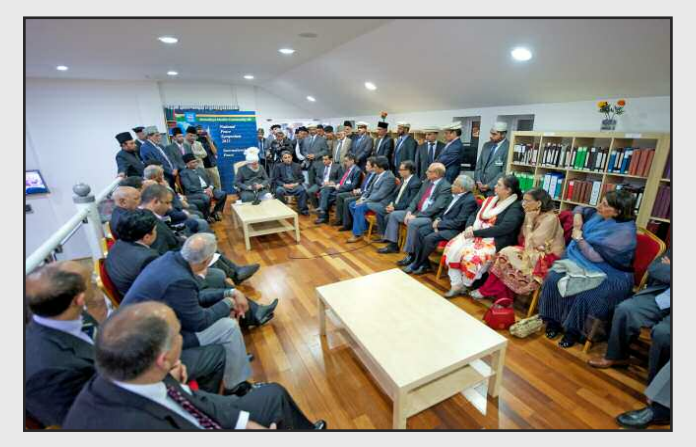
Members of the Urdu speaking media meeting the Khalifa.