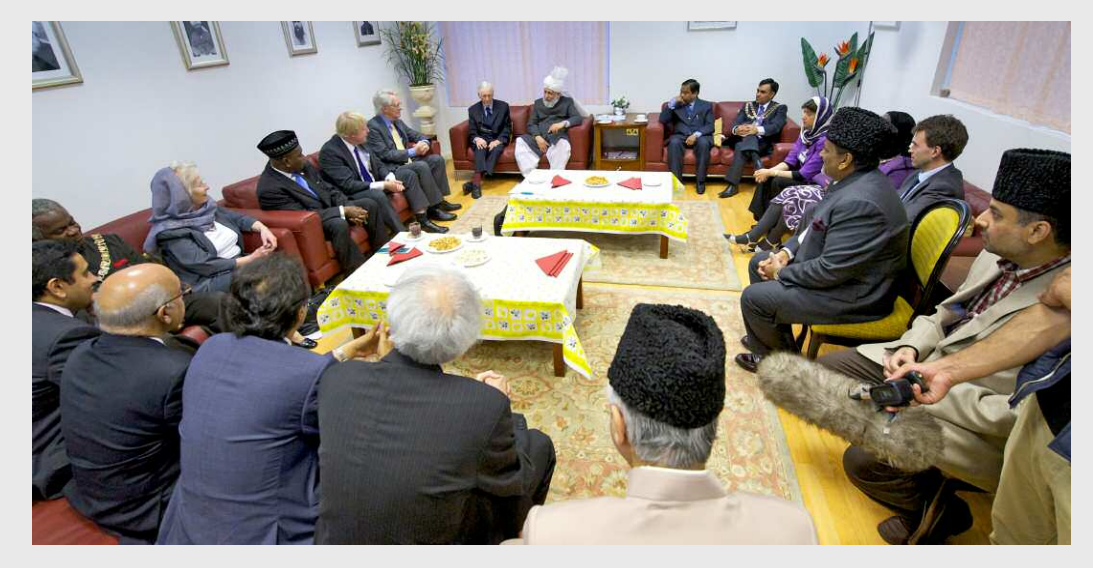
Private audience with Hadhrat Mirza Masroor Ahmad before start of symposium.