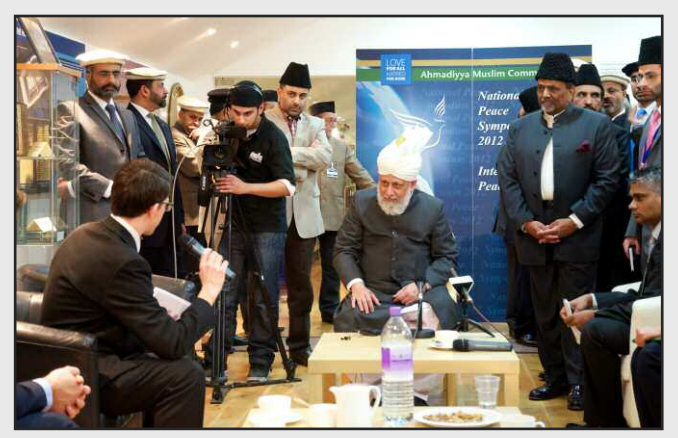
Members of the English media meeting the Khalifa after the symposium.