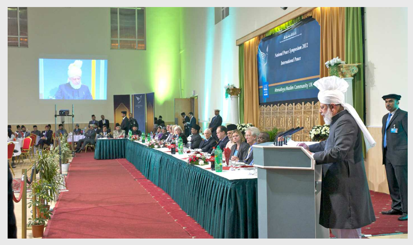
Some of the other key dignitaries who attended included: