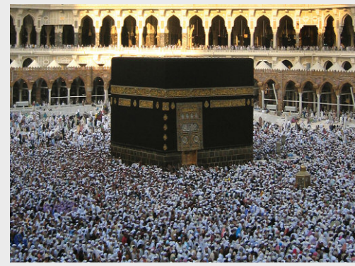
The Holy Ka'bah in Makkah, Saudi Arabia

"Kindness is a mark of faith, and whoever has no kindness has no faith." (Muslim)