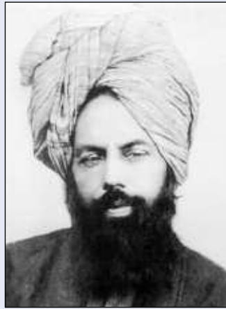
Hadhrat Mirza Ghulam Ahmad The Promised Messiah and Mahdi

The Ahmadiyya Muslim community was established in India in 1889 by Hadhrat Mirza Ghulam Ahmad of Qadian, India – the Promised Messiah and Imam Mahdi. One of the greatest bounties of the Ahmadiyya Muslim community is that it has been blessed with the institution of Khilafat – a system of spiritual leadership in Islam as set out in the Holy Qur'an. It is the means of uniting Muslims into one cohesive body under one spiritual leader. It was the system of leadership that was established in the early period of Islam after the demise of the Holy Prophet Muhammad (saw) and was reinstated in 1908 after the demise of the holy founder of the Ahmadiyya Muslim community.