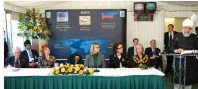
Address on 'The Islamic Perspective on the Global Crisis' by his Holiness delivered at the House of Commons – 22nd October 2008

...We are using all means and resources available to us to bring man nearer to God, because if human beings can really recognise their Creator today, they will be able to fulfil their responsibilities towards their fellow beings."