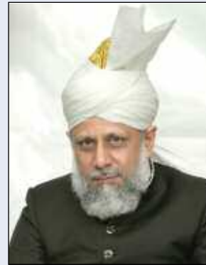
Hadhrat Mirza Masroor Ahmad Head of the worldwide Ahmadiyya Muslim community

The Ahmadiyya community is now passing through another golden era of the fifth Khalifa, Hadhrat Mirza Masroor Ahmad, who holds the worldwide Ahmadiyya community together as one. He ensures that every step taken is in the right direction, fulfilling the mission of the Promised Messiah (as) . The Khalifa is particularly dedicated to ensure that Islam is properly understood as a religion of peace throughout the world. He has repeatedly emphasised the fact that Islam rejects violence in any form and for any reason as it is completely at odds with Islam – a word which itself means 'peace.'