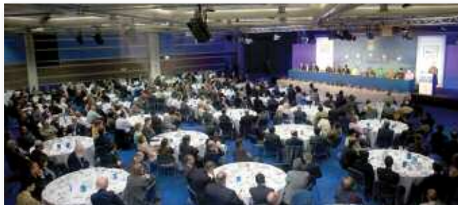
Address on 'The True Embodiment of Islam' by his Holiness at the Queen Elizabeth II Conference Centre – 10th June 2008