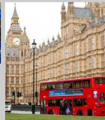
Houses of Parliament