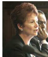
Rt Hon Hazel Blears MP

So Amnesty International is looking at the Pakistani government and other governments in the region very simply to fulfil their obligations under international law to avoid religious discrimination and protect the rights of religious minorities.