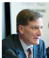
Rt Hon Dominic Grieve QC MP